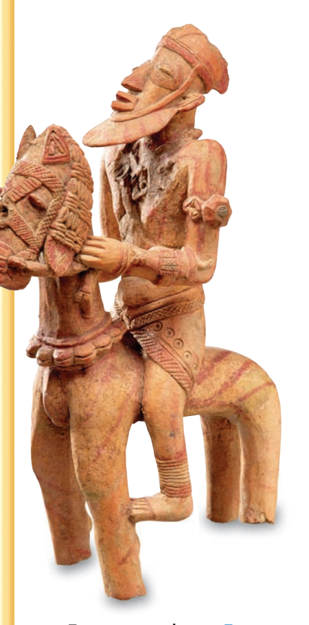
▲ Terracotta sculpture Terracotta is the type of clay used to make this sculpture. This sculpture was made around the 14th century in Mali, West Africa.